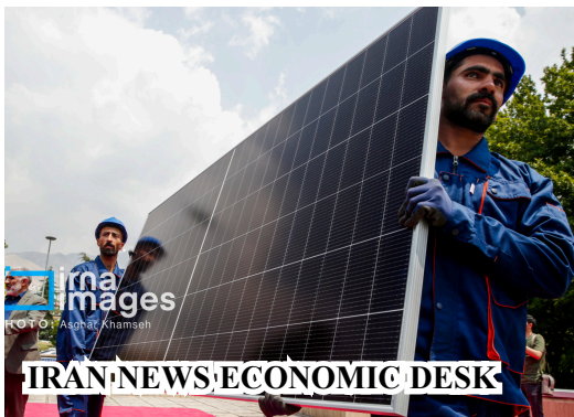
IRAN NEWS ECONOMIC DESK