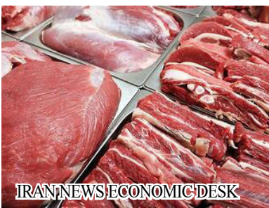
IRAN NEWS ECONOMIC DESK