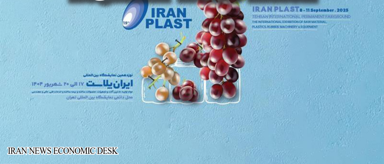
IRAN NEWS ECONOMIC DESK