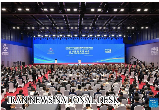
IRAN NEWS NATIONAL DESK