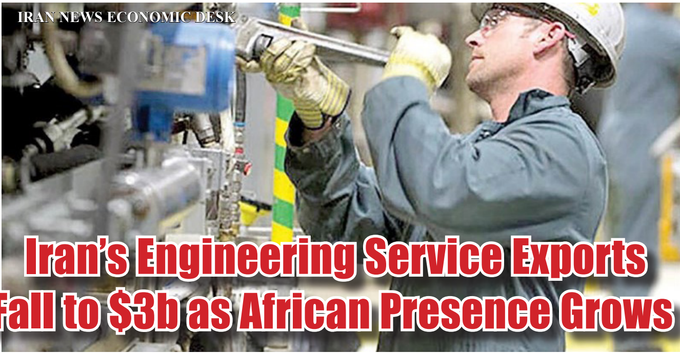
IRAN NEWS ECONOMIC DESK