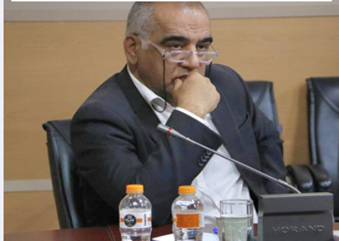
IRAN NEWS ECONOMIC DESK