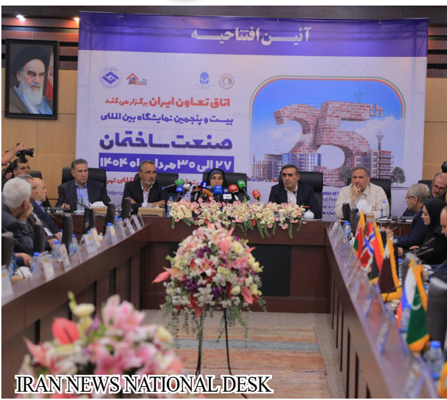
IRAN NEWS NATIONAL DESK

The country has capacity for more than one million tons of annual steel structure exports, worth an estimated $2.5 billion.