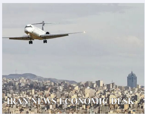
IRAN NEWS ECONOMIC DESK

TEHRAN - Iran Air, the national flag carrier of the Islamic Republic of Iran, has launched a direct flight from Tabriz to Baku as part of efforts to enhance tourism and strengthen regional ties under the guidelines of the country's Seventh Development Plan.