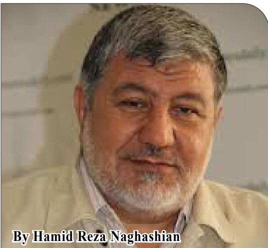
By Hamid Reza Naghashian

Twelve days of war with the U.S., decisively and undeniably orchestrated by the Zionist regime and supported by Western and Arab states backing the bloodthirsty Zionist regime, have melted the frozen zeal of those in Iran who lack honor but have not become un-Iranian.