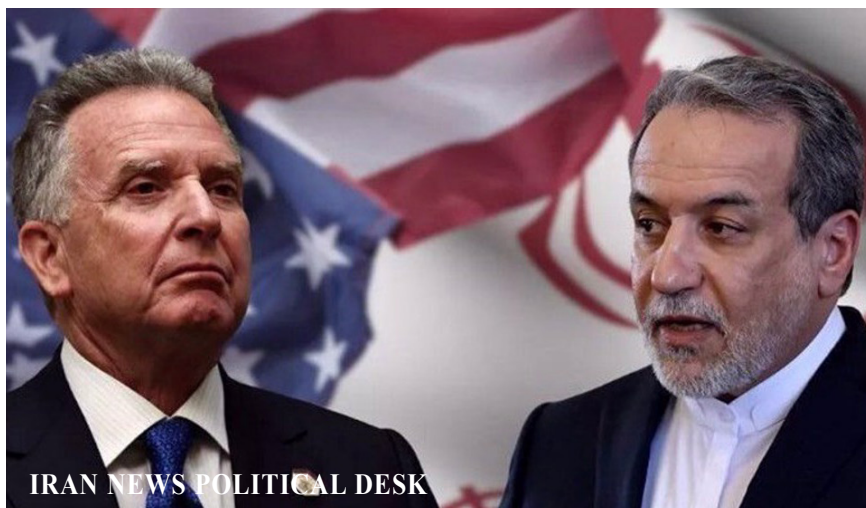
IRAN NEWS POLITICAL DESK

"No inappropriate language was used. Both sides demonstrated their determination to advance the talks until an agreement is reached that is desirable for both parties and is based