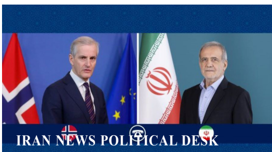
TEHRAN - President Masoud Pezeshkian says tension, unrest and conflict will be detrimental to Iran, the region and the entire world.

In a phone conversation on Sunday, Norway's Prime Minister Jonas Gahr Støre and the Iranian president discussed bilateral and multilateral issues.