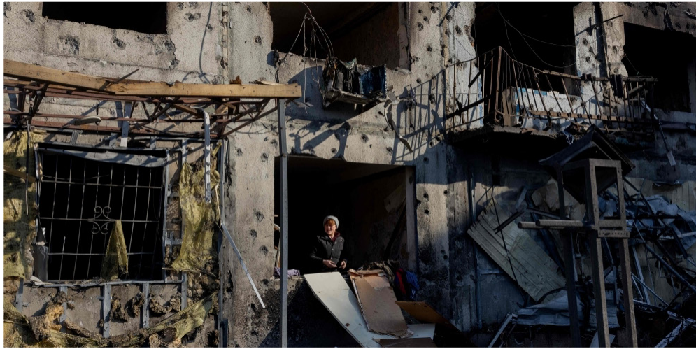
Mohammed bin Salman.

The Ukrainian military General Staff said Saturday that clashes were ongoing amid heavy bombardment with artillery and guided aerial bombs.