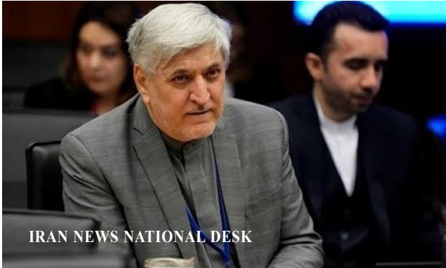
IRAN NEWS NATIONAL DESK

"The E3 cannot pursue the same legal course against Iran, as such an action contradicts both