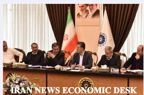
IRAN NEWS ECONOMIC DESK

TEHRAN - The Governor of West Azerbaijan province has emphasized the importance of boosting trade with neighboring countries.