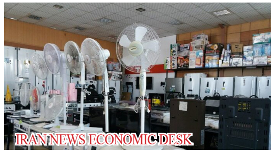
IRAN NEWS ECONOMIC DESK

TEHRAN - Despite facing numerous challenges, Iran's domestic appliance industry experienced a 10% growth in production during the period from the beginning of the year to the end of January, according to reports.