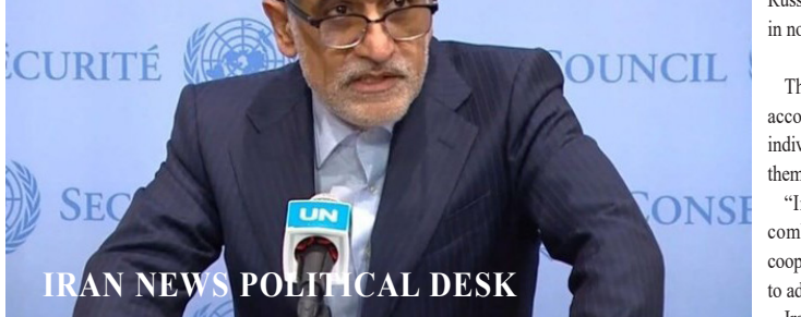
IRAN NEWS POLITICAL DESK

The president added that solidarity, interaction and planning play a key role in settling domestic problems.