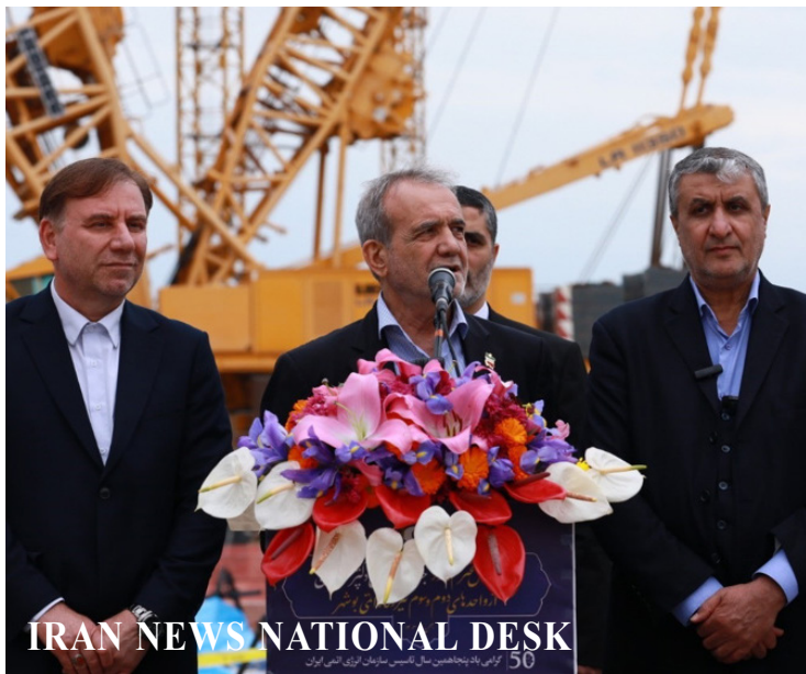
IRAN NEWS NATIONAL DESK

Besides recovering an investment equivalent to four times the plant's construction cost,