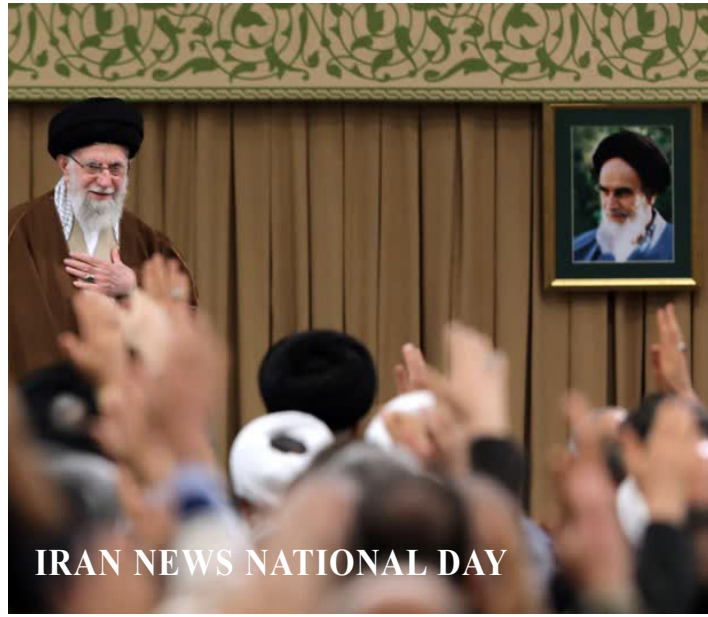
IRAN NEWS NATIONAL DAY

Ayatollah Khamenei noted that, "Despite ongoing media bombardments, psychological warfare, and unfounded threats from adversaries against the historic development, the Iranian people stood strong in their commitment to the values of the Revolution with their indication of strong support for the event during this year's marches and jubiliations."