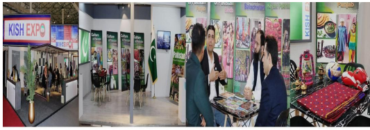
Embassy of Pakistan Participates in Kish Expo 2025 IRAN NEWS ECONOMIC DESK

TEHRAN - The Embassy of Pakistan in Tehran proudly participated in the Kish Expo 2025, showcasing the country's vibrant business development capabilities, rich cultural heritage, and diverse tourism opportunities. The event, held on Kish Island, provided a prominent platform for Pakistan to connect with international businesses and investors, fostering collaboration and promoting its economic growth potential. The Embassy's participation highlighted Pakistan's strong commitment to enhancing bilateral ties, strengthening economic partnerships, and promoting cultural exchange. A variety of initiatives were showcased at the event, reflecting Pakistan's dynamic tourism industry and its commitment to fostering sustainable development and investment opportunities across various sectors. This engagement aligns with the Embassy's continued efforts to facilitate economic diplomacy, expand trade relations, and introduce Pakistan's cultural and tourism treasures to a global audience.