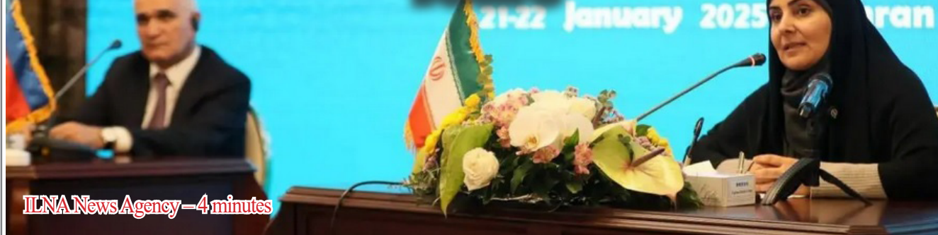
ILNA News Agency - 4 minutes