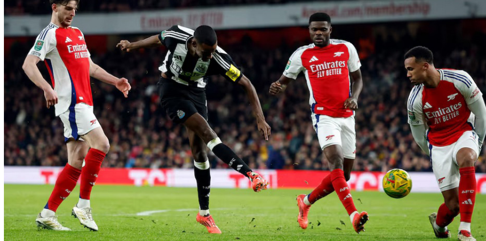
Three days ago they won 2-1 at Tottenham to move closer to the Premier League's top four and they returned to send the travelling Toon Army back up north in high spirits. Isak has been virtually unstoppable of late and he has now scored 10 goals in his last nine appearances for the club. Jurrien Timber also headed over the crossbar from close range for the hosts and Havertz was even more culpable after the break when he somehow failed to connect with a header with the goal gaping, the ball bouncing off his shoulder.

LONDON (Dispatches) - Alexander Isak scored his 50th goal for Newcastle United as Eddie Howe's side took a huge step towards the League Cup final with a 2-0 victory at Arsenal on Tuesday. Isak struck shortly before halftime in the first leg of the semi-final at a chilly Emirates Stadium and then had a big role in Newcastle's second scored by Anthony Gordon after the break. Arsenal were left to rue their failure to convert several good chances with Gabriel Martinelli denied by the woodwork in the first half and Kai Havertz missing a golden opportunity. In-form Newcastle, who have not won a major trophy since 1955, will now be clear favourites to complete the job in the second leg on Tyneside next month. Tottenham Hotspur host holders Liverpool in the first leg of the other semi-final on Wednesday. Arsenal had been unbeaten in their previous 13 games in all competitions but were not at their best against a clinical Newcastle side who have taken a liking to north London.