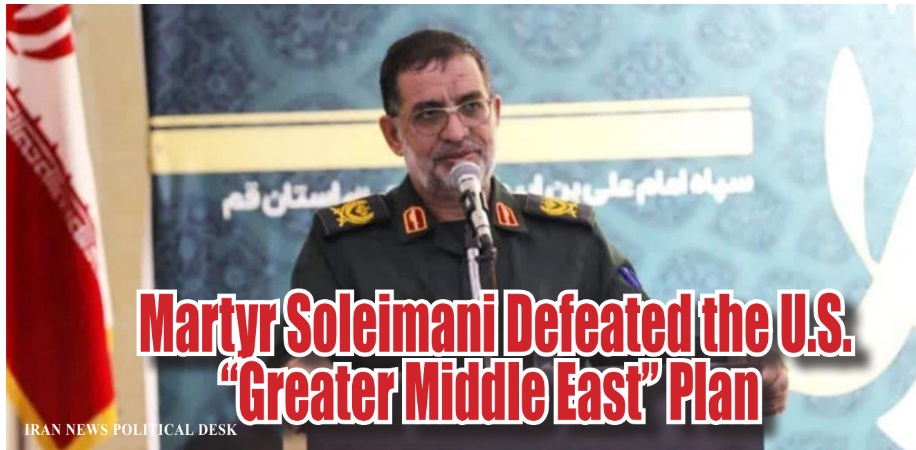
TEHRAN - The spokesperson for Iran's Islamic Revolutionary Guard Corps (IRGC) stated that Martyr Qassem Soleimani was a symbol of unity, defeating the American "Greater Middle East" plan, and solidifying a powerful front against the Zionist regime while fostering unity in Syria.

General Soleimani, commander of the Quds Force of Iran's Islamic Revolution Guards Corps (IRGC), and Abu Mahdi al-Muhandis, the second-in-command of Iraq's Popular Mobilization Units (PMU), and their companions were assassinated in a US drone strike authorized by then-US President Donald Trump near the Iraqi capital Baghdad's International Airport on January 3, 2020.