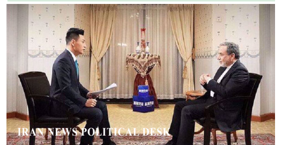
IRAN NEWS POLITICAL DESK

TEHRAN - Foreign Minister Abbas Araqchi has said that the Islamic Republic is ready for constructive negotiations to reach an agreement regarding its nuclear program.