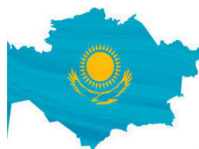
IRAN NEWS NATIONAL DESK

Babol University of Medical Sciences, established in 1984, was the first medical university in northern Iran. Located in southern Babol, it spans a 40-hectare campus surrounded by Hyrcanian forests and fruit trees like oranges, apples, and pomegranates.