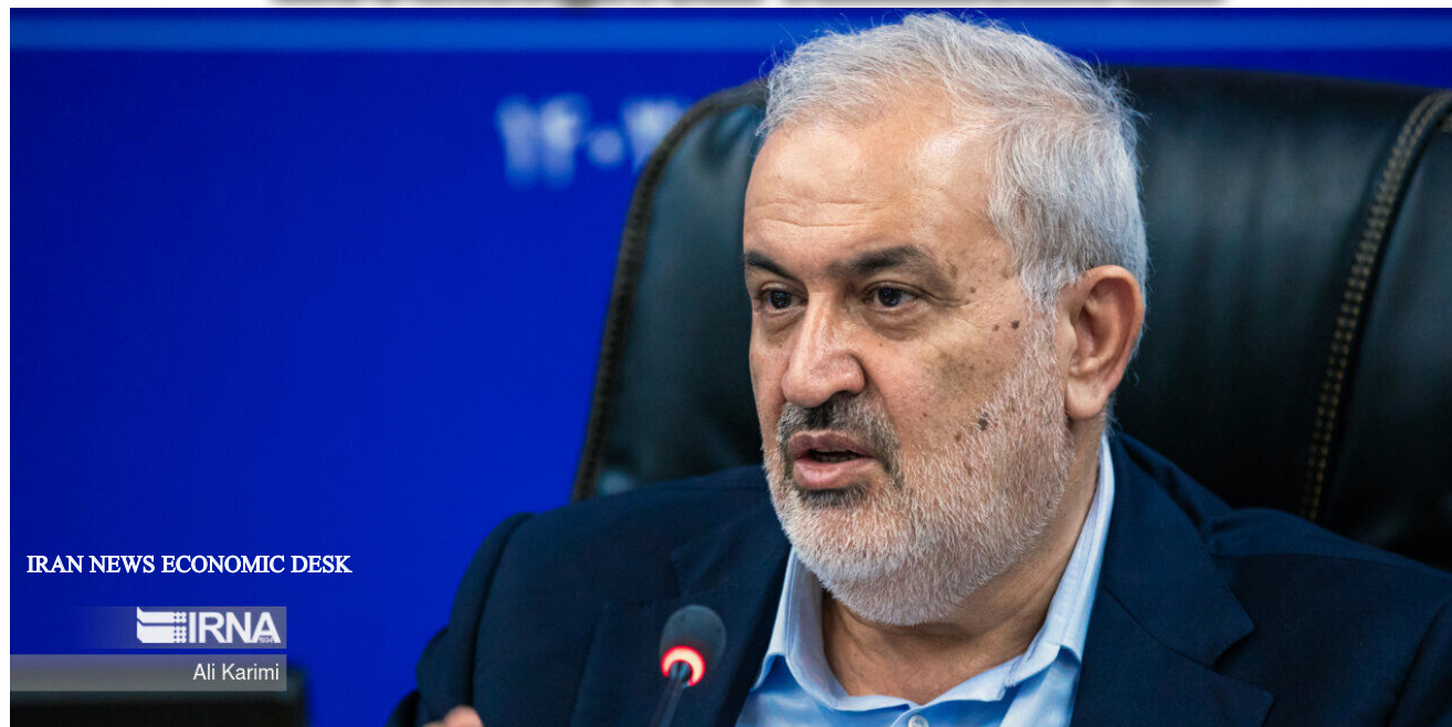
IRAN NEWS ECONOMIC DESK