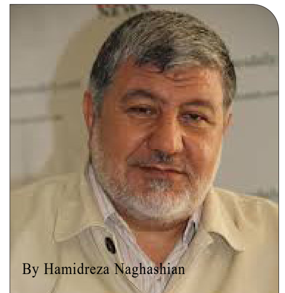
By Hamidreza Naghashian

Syria's geopolitical significance in West Asia and its alignment with the Axis of Resistance cannot be analyzed solely within the framework of Syria itself. Since the Islamic Revolution in Iran, during the late President Hafez al-Assad's era, Syria tied itself to Iran in such a way that it often acted as a vanguard against Western policies, which at the time were implemented through Saddam Hussein.