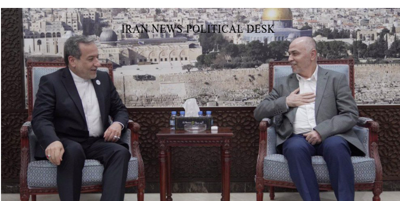
IRAN NEWS POLITICAL DESK

The regime's bloody onslaught on Gaza has so far killed at least 44,664 Palestinians, mostly women and children, and injured more than 105,976 others. Thousands more are also missing and presumed dead under rubble.