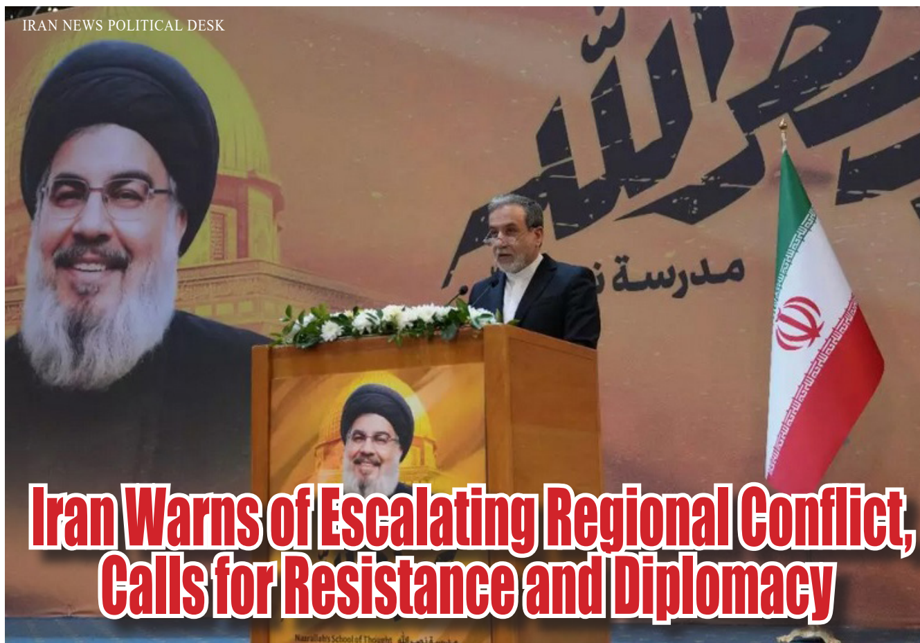
IRAN NEWS POLITICAL DESK

The sides discussed issues of common interest and stressed the importance of improving cooperation in the fields of defense, border management and the fight against terrorism.