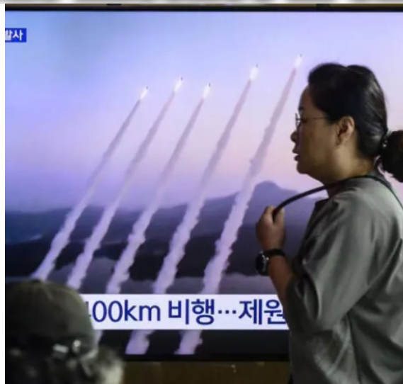
Seoul's Joint Chiefs of Staff (JCS) said it had "detected and (was) analysing several short-range ballistic missiles launched to the northeast

The North is also preparing for a parliamentary meeting in October that is expected to approve measures likely to escalate tensions with South Korea, including incorporating the hostile relationship between the two Koreas into its constitution.