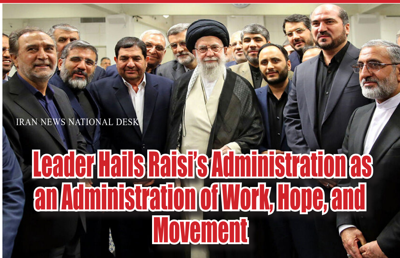
IRAN NEWS NATIONAL DESK