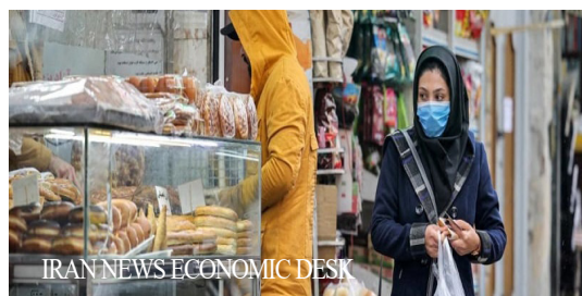
IRAN NEWS ECONOMIC DESK