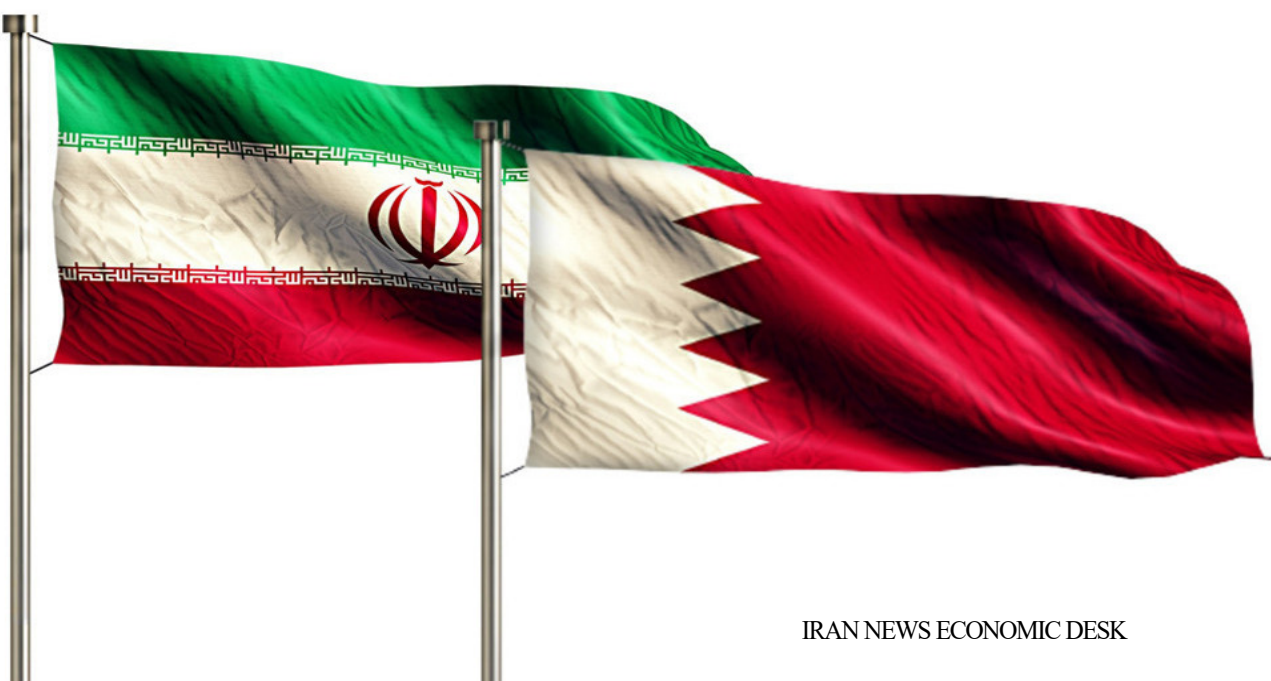
IRAN NEWS ECONOMIC DESK

TEHRAN - Negotiations between the Deputy for International Affairs of the Central Bank of Iran and the Deputy of the Central Bank of Bahrain have commenced with the aim of releasing the blocked assets of the Central Bank of the Islamic Republic of Iran and other Iranian banks in Bahrain. These discussions will continue until a resolution is reached.