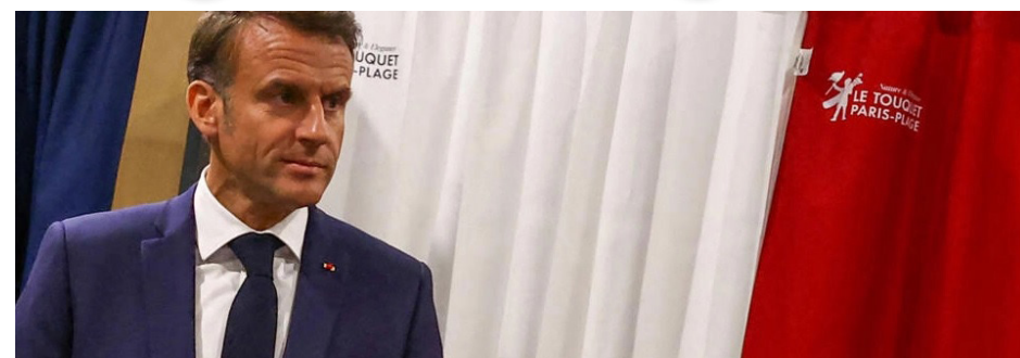
coalition with a far-right prime minister.

RN co-leader Marine Le Pen said the party's fellow leader and her protege, 28-year-old Jordan Bardella, would be its contender for prime minister. Le Pen, who was runner-up in the last two presidential elections, is largely expected to tilt for the top job again in 2027. However, it will not be plain sailing for the RN as the party still provokes widespread hostility. Demonstrators took to the streets of Paris, Marseille, Rennes, Lyon and several other large cities on Monday evening to show their opposition to the far right. Five labour unions also called for mass protests this weekend, warning that "our republic and our democracy are in danger" if the far right wins again at the end of the month. The RN came in first in the French EU parliament voting with more than 31 percent, a score more than double that of Macron's list with 14 percent. The Socialists and hard-left France Unbowed trailed behind with 13 and nine percent each. The Socialists and three other left-wing parties -- France Unbowed, the Communists and the Ecologists -- announced late Monday that they would unite for the legislative elections as part of a "popular front... to fight the far-right's racist project".