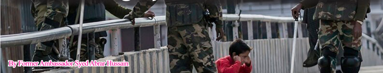
By Former Ambassador Syed Abrar Hussain