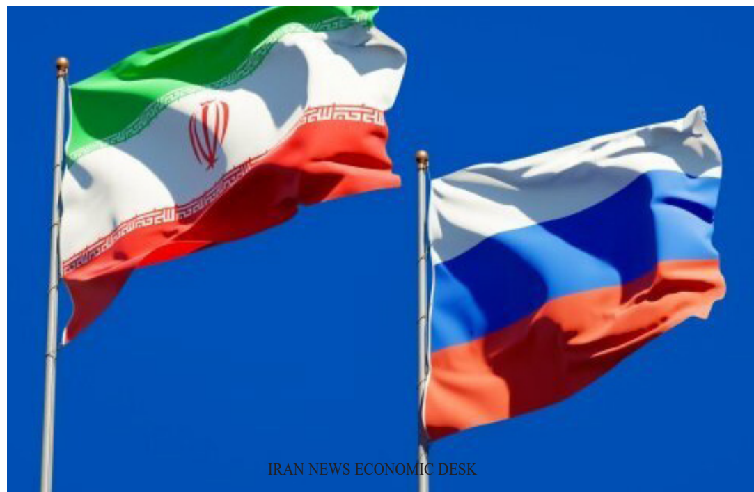
IRAN NEWS ECONOMIC DESK