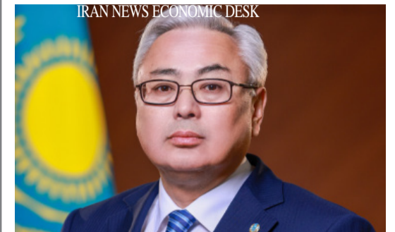
IRAN NEWS ECONOMIC DESK