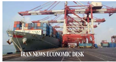
IRAN NEWS ECONOMIC DESK