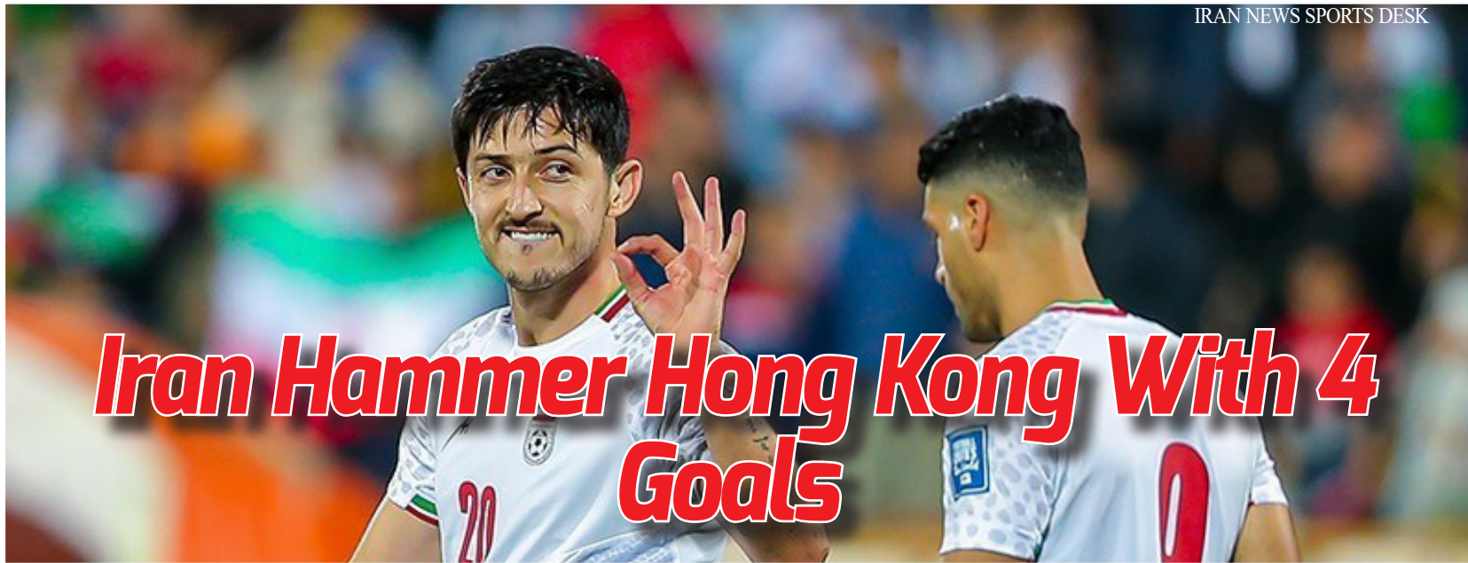
IRAN NEWS SPORTS DESK