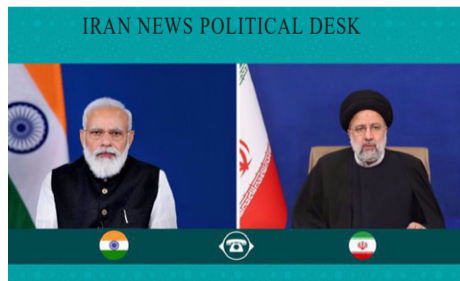
IRAN NEWS POLITICAL DESK