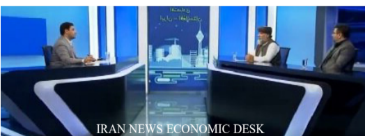
IRAN NEWS ECONOMIC DESK