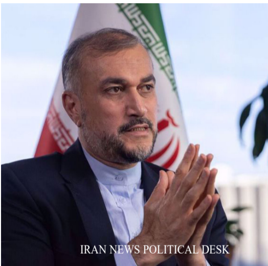
IRAN NEWS POLITICAL DESK

TEHRAN - Foreign Minister Hossein Amir-Abdollahian says Tehran has received a new message from Washington claiming that the US seeks a ceasefire in the Gaza Strip, but they continue to support Israel's genocide in the Palestinian territory in practice. The minister, who was speaking to reporters on the sidelines of a Monday meeting between Iranian and Iraqi heads of governments in Tehran, said, however, that the message did not correspond to what the U.S. has done in practice in Gaza where it has supported the Israeli crimes against the civilians. "The Americans ... delivered a message to us in the past three days (claiming) that they are after ceasefire and have carried out efforts in this regard," said Amir-Abdollahian, adding that "they, however, back mass killing and genocide" of people in Gaza. "We hope that the U.S. will soon change its policy and stop supporting the occupying party," he said. The U.S. had sent similar messages to Iran, a country with influence over resistance groups in Palestine, since the Israeli aggression on Gaza started on October 7, according to statements by Amir-Abdollahian and other authorities. Amir-Abdollahian also commented about reports suggesting that his U.S. counterpart Antony Blinken had arrived in the Iraqi capital Baghdad on Sunday while wearing a bullet-proof vest out of fears that he could be targeted because of his support for the Israeli carnage in Gaza. "This is the reality about the U.S. role in the region," said the diplomat.