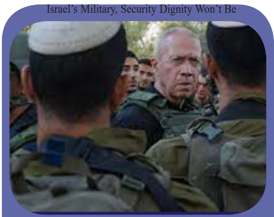
Israel's Military, Security Dignity Won't Be