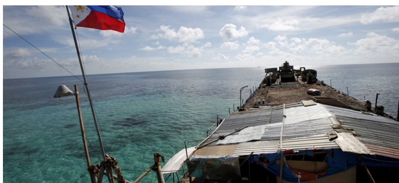
continue to do what is necessary to firmly safeguard its territorial sovereignty and maritime rights and interests, it said.