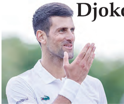
Casper Ruud, who he beat in the French Open final earlier this month.

Top seed and world number one Carlos Alcaraz has not been beyond the fourth round at