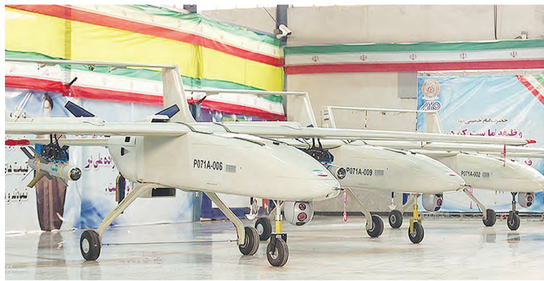
IRAN NEWS POLITICAL DESK

TEHRAN - Iran's permanent mission to the United Nations has dismissed the latest claim by the United States and its allies regarding Russia's use of Iranian drones in the Ukraine war.