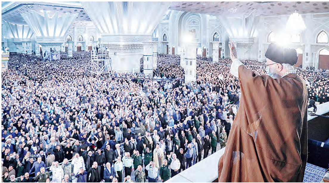
IRAN NEWS NATIONAL DESK