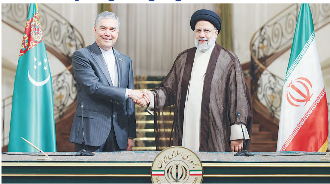
IRAN NEWS NATIONAL DESK