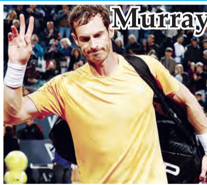
Murray, who had been hoping to boost his world ranking with a deep run in Rome and be seeded for Roland Garros, said it had been a "pretty patchy match" against the Italian. "There was some good stuff in there, but also some pretty average stuff," he was quoted