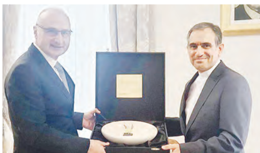
between Iran and six world powers — including the United States — in 2015.

The Iran nuclear deal, officially known as the Joint Comprehensive Plan of Action, or JCPOA, was concluded after years of negotiations