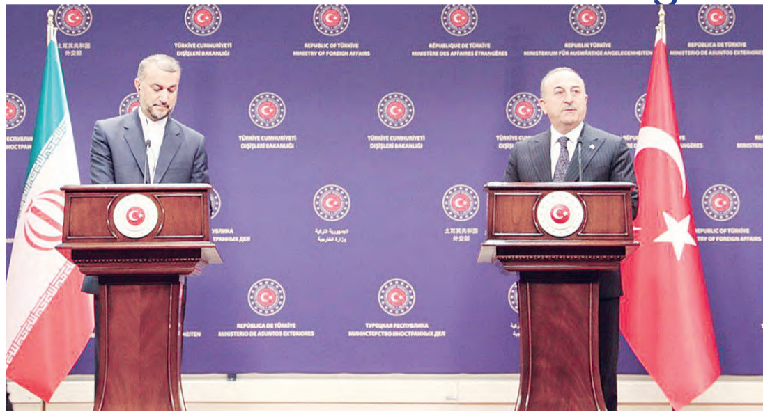
IRAN NEWS POLITICAL DESK

TEHRAN - Foreign Minister Hossein Amirabdollahian has said that the presence of the Israeli regime in the Caucasus region is among the important issues facing the region.