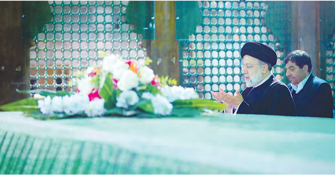
IRAN NEWS NATIONAL DESK