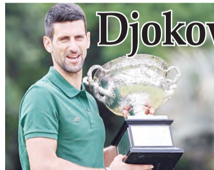
Djokovic's 10th Australian Open title means he is world number one for the 374th week since July 2011.

McIlroy blew his chances last year when he hit his second shot into the water on the final hole -- and he almost repeated the scenario with his tee shot on the 18th.