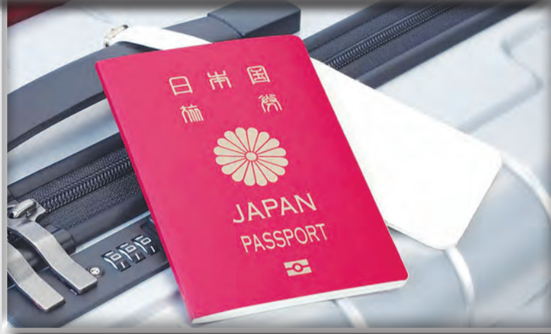
World's most powerful passports 2023

"While we don't usually associate our passports with financial affairs, the research reveals that a powerful passport is a conduit to economic opportunity and wellbeing."