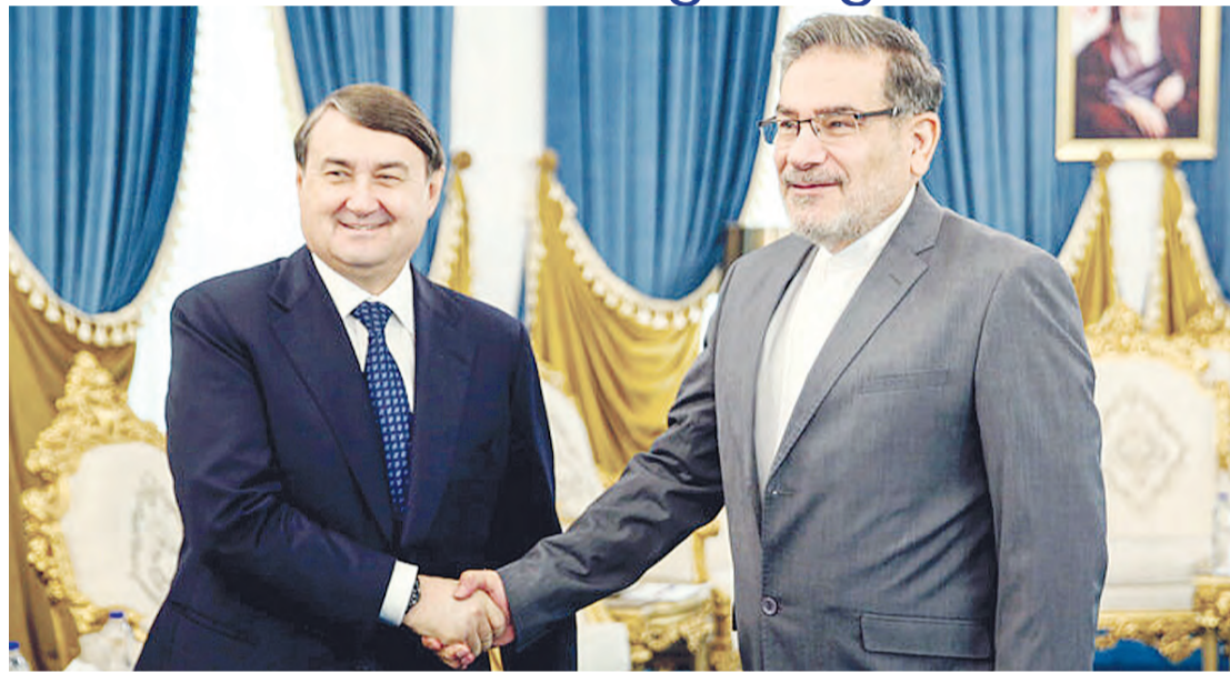
IRAN NEWS POLITICAL DESK

TEHRAN - Iran's top security chief says Tehran and Moscow are strengthening their economic cooperation in line with strategic agreements through constant efforts and a firm determination.