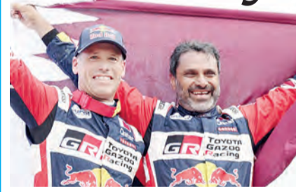
Sebastien Loeb, the nine-time world rally champion chasing his first Dakar success, was second in successive years, more than 80 minutes behind.

RIYADH (Dispatches) - Nasser Al-Attiyah won a second straight Dakar Rally just kilometers from his Qatar homeland.