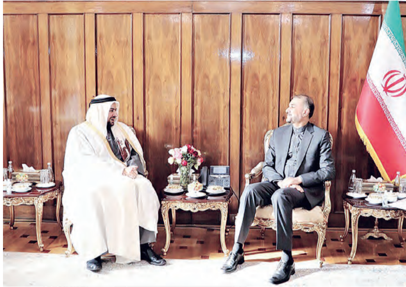
The Qatari side also expressed the Qatari government's readiness to develop and promote cooperation with Iran, conveying the message of Qatar's Minister of Foreign Affairs to his Iranian counterpart.

The Iranian diplomat also emphasized the necessity of implementing the agreements reached between the two countries during the previous meetings.