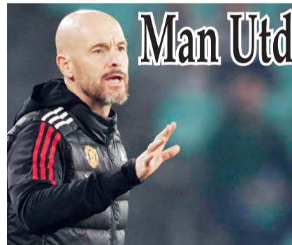
Rashford has rediscovered his form this season under new boss Ten Hag, playing 20 matches in all competitions and scoring nine goals. Dalot, Fred and Shaw have also been

LONDON (Dispatches) - Brentford head coach Thomas Frank has signed a two-year contract extension that will keep him at the Premier League club until 2027, the club said. Frank, who took charge in 2018, led the London club to the top flight for the first time in 74 years. The Dane guided Brentford to a 13th-placed finish in their first season in the Premier League. "I have been here six years in total, which is a long time in modern football, and I'd like to say thank you to the fans for the support you give us - the players, the staff, everyone involved with the club," Frank said in a statement. Frank last signed an extension in January this year, and his previous contract was set to run until 2025.