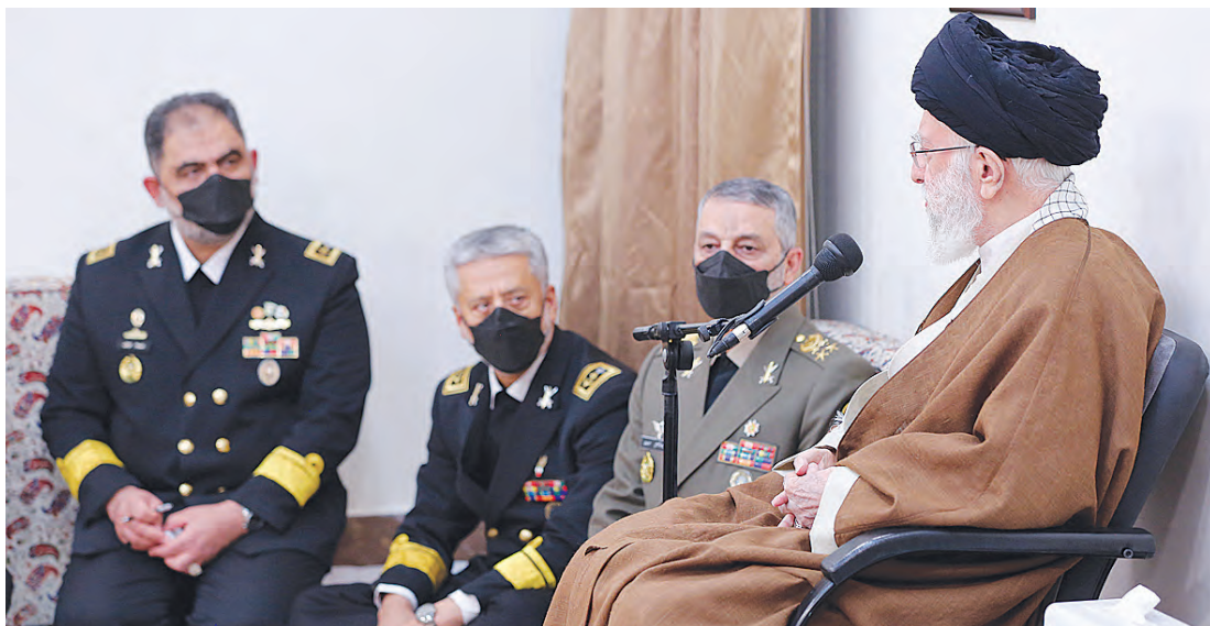
IRAN NEWS NATIONAL DESK

TEHRAN - Leader of the Islamic Revolution Ayatollah Seyed Ali Khamenei stressed the need for the Iranian Navy to bolster and maintain its presence in international waters.