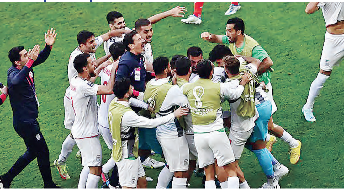
IRAN NEWS SPORTS DESK

TEHRAN - Iran claimed a famous 2-0 victory over 10-man Wales on Friday as Carlos Queiroz's men scored two goals deep into added time to keep their World Cup campaign alive. The Iran players, who sang the national anthem before kick-off, sent their thousands of supporters at the Ahmad Bin Ali Stadium delirious by beating a European team at a World Cup for the first time. Wales goalkeeper Wayne Hennessey became the first player to be sent off in the Qatar tournament for clattering into Mehdi Taremi late in the game. Iran, who had earlier twice struck the woodwork, finally broke the deadlock in the 98th minute through substitute Rouzbeh Cheshmi's powerful drive. Ramin Rezaian clipped in a second on the counter-attack three minutes later. Iran, who would have been eliminated with a defeat, instead climbed to second in Group B behind England, against whom they had lost 6-2 in their opening game. Wales tumbled to the bottom of the group and will have to defeat neighbours England in their final match next week to have any chance of reaching the knockout phase in their first World Cup since 1958. Wales manager Rob Page elected to start striker Kieffer Moore after his impressive appearance as a substitute against the USA. See Page 7