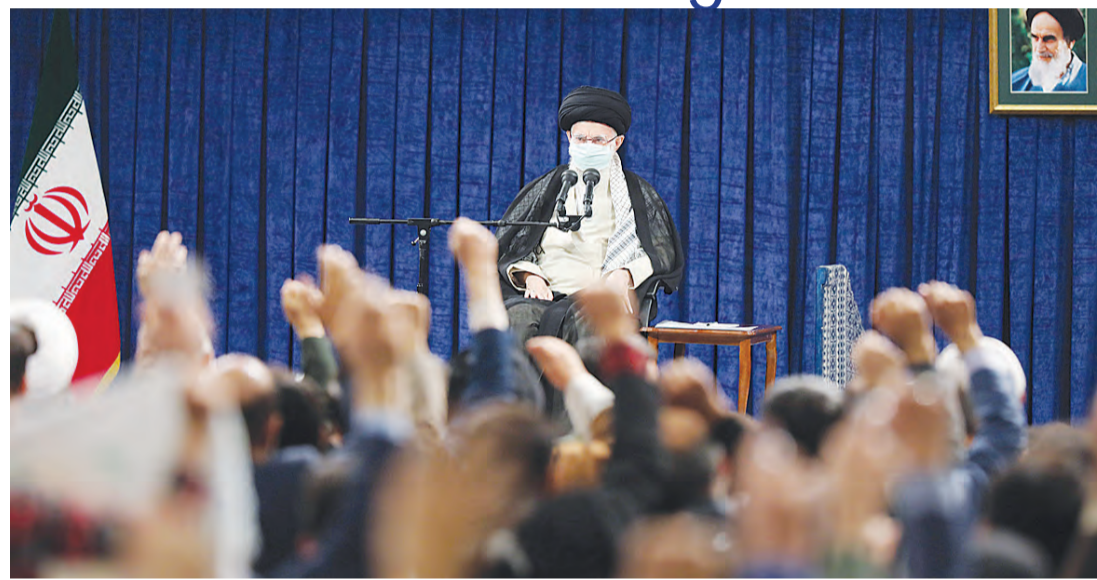
IRAN NEWS NATIONAL DESK

TEHRAN – Supreme Leader of the Islamic Revolution Ayatollah Seyyed Ali Khamenei says arrogant powers are disgruntled by Iran's scientific advances as tremendous progress being achieved by the Islamic Republic is consigning liberal democracy propagated by the West to history.