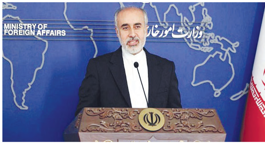
IRAN NEWS POLITICAL DESK