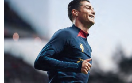
117 goals, has plenty of younger team-mates in support in attack, including Atletico Madrid's Joao Felix and AC Milan's Rafael Leao.

OEIRAS (Dispatches) - Cristiano Ronaldo will lead Portugal into the World Cup after Fernando Santos named the veteran forward in his 26-man squad. The Manchester United striker, 37, has not been first choice for his club this season but will be part of his country's bid to win the tournament for the first time in their history. Ronaldo, the captain and all-time leading scorer in men's international football with 117 goals, has plenty of younger team-mates in support in attack, including Atletico Madrid's Joao Felix and AC Milan's Rafael Leao. "All the players I have called up come with the hunger to win and make Portugal world champions, Ronaldo included," said Santos.