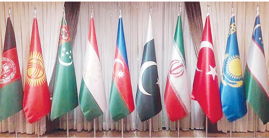
IRAN NEWS ECONOMIC DESK

TEHRAN - Trade between Iran and the Economic Cooperation Organization's member states exceeded 10.67 million tons during the current fiscal year's first six months.