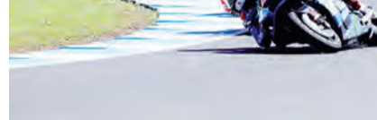
Rins Wins Australian MotoGP

PHILIP ISLAND (Dispatches) - Spain's Alex Rins stormed to a pulsating win at the Australian MotoGP Sunday with world championship leader Fabio Quartararo crashing out to put a huge dent in his title hopes.