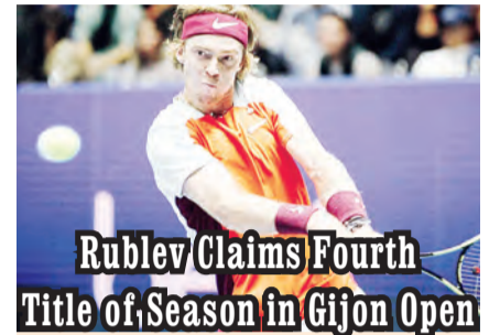
Rublev Claims Fourth Title of Season in Gijon Open

The Dutchman, though, rose to the challenge of stopping Haaland and made one vital intervention to turn Cancelo's cross away from the City number nine.