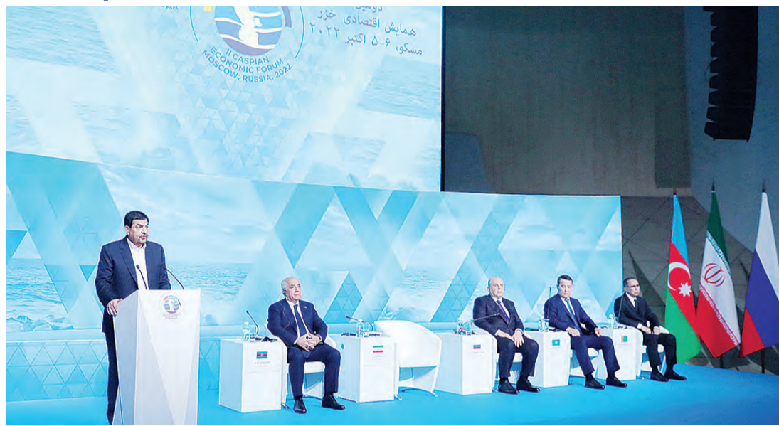
IRAN NEWS POLITICAL DESK

TEHRAN - First Vice-President called for formation a joint free economic zone among the Caspian Sea littoral states on Thursday.