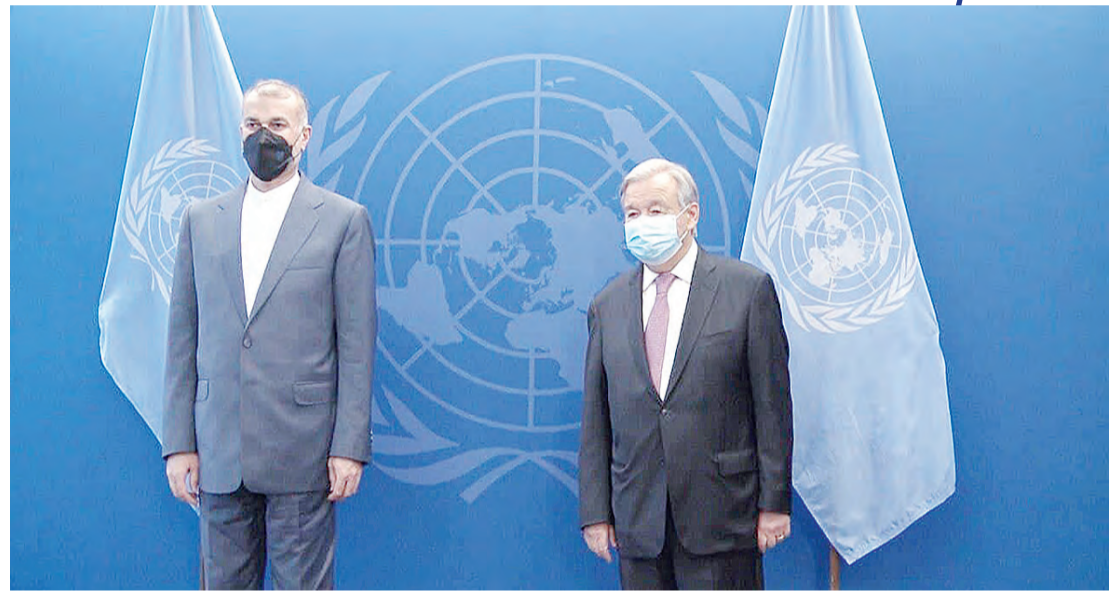
IRAN NEWS POLITICAL DESK

TEHRAN - Foreign Minister Hossein Amirabdollahian has criticized the ongoing Nuclear Non-Proliferation Treaty (NPT) Review Conference for refusing to call on the Israeli regime to join the treaty.