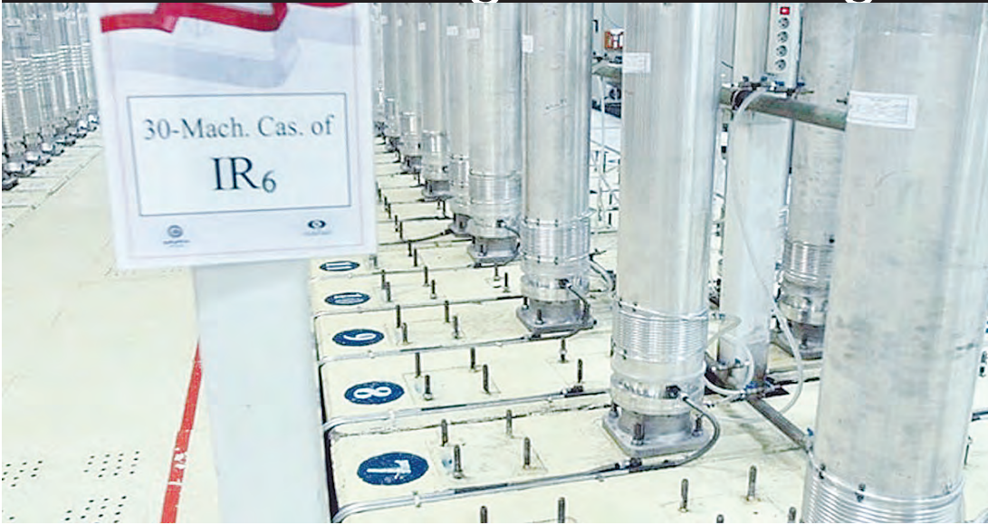
IRAN NEWS NATIONAL DESK

TEHRAN - Iran will not shy away from any action to safeguard its national rights against increasing pressures, Iran's nuclear chief has said, days after the country began to feed gas into cascades of new centrifuges as an immediate response to a fresh round of U.S. sanctions.